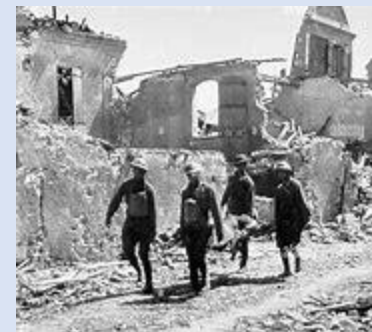
Role of medics in WW1