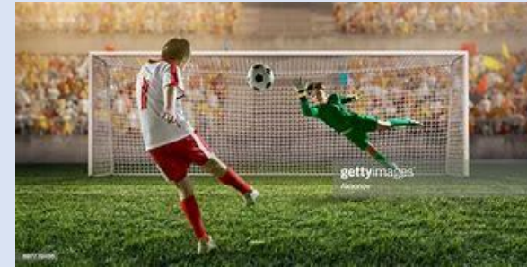
Scoring a goal