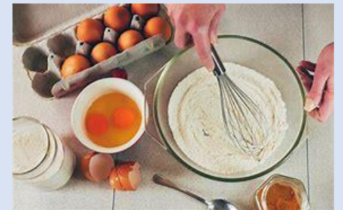
Baking a cake